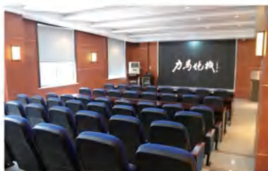
企业培训中心(阶梯教室) Enterprise Training Center (Ladder Classroom)