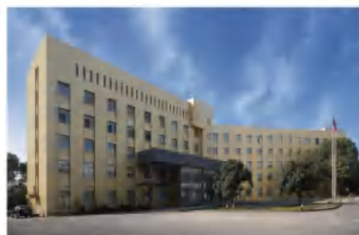
办公科技大楼 Office/design building