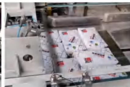
高位码垛8包回字型 8 packages per layer