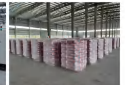
无托盘码垛套膜后的袋垛 Bag stack after film covering (without pallet stacking)