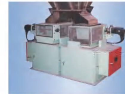
自动称量包装机(伺服控制给料) Auto weighing machine (Servo control feeding)