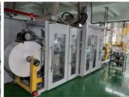
膜卷输送热合制袋 Film roll conveying