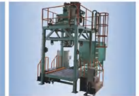
大袋自动称量包装机 Auto weighing machine for big bag