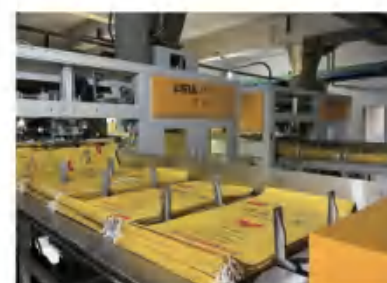
化肥全自动包装机(适用于双层塑料薄膜袋) Fertilizer auto packaging machine (suitable for double-layer plastic film bags)