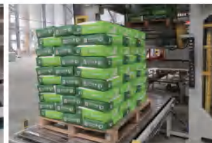
水泥高位码垛机 Cement palletizer