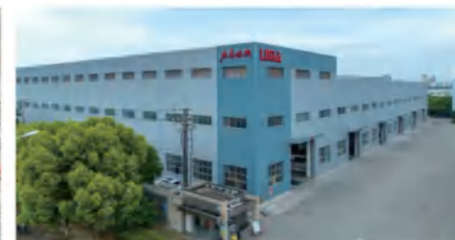
重型设备生产车间外景(起重能力250T) Pressure Vessel Production Workshop (With 250T lifting capacity)

无锡力马化工机械有限公司(原国营无锡化工机械厂),始建于1966年。公司为国家高新技术企业,国家专精特新小巨人企业,具有I、II、III类压力容器、高压容器设计和制造证书及美国ASME U 钢印证书。