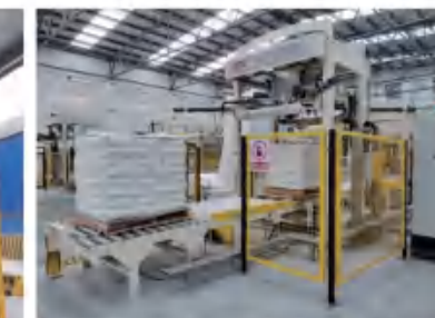
拉伸套膜机用户现场 User site