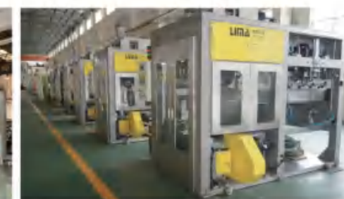
全自动包装机总装 Auto packaging machine assembly