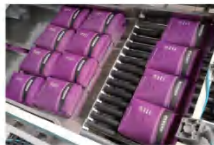
高位码垛12包每层 Palletizer with 12 packages /Layer