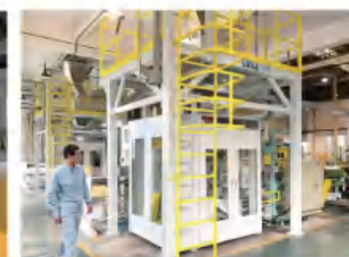
塑料粒子全自动包装机 PP auto packaging machine