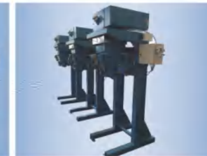
自动称量包装机(毛重) Auto weighing machine (Gross weight)