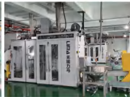
FFS包装机用户现场 FFS packaging machine user site