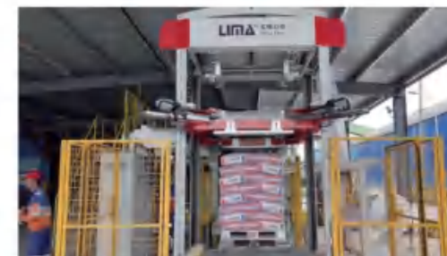
水泥袋垛拉伸套膜 Film stretching & covering machine