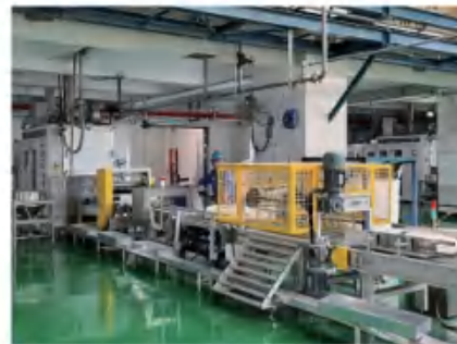
FFS热合制袋包装机 FFS packaging machine