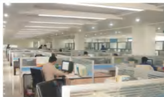
技术设计中心 Design Center