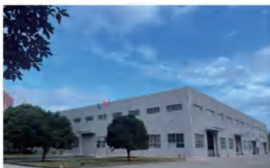
包装码垛总装调试车间 Final assembly & debugging workshop of bagging & palletizing machine